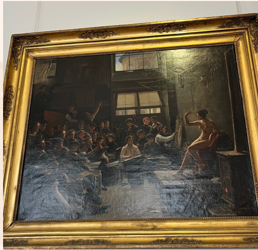
• 'Académie Atelier' – Antoine- Jean Gros