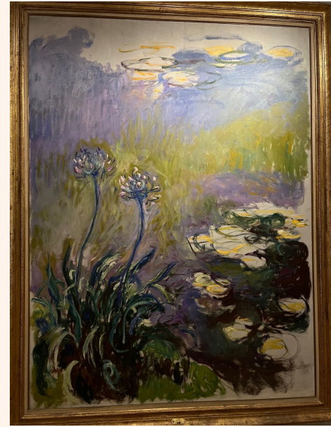
• 'Les Agapanthes' – Claude Monet